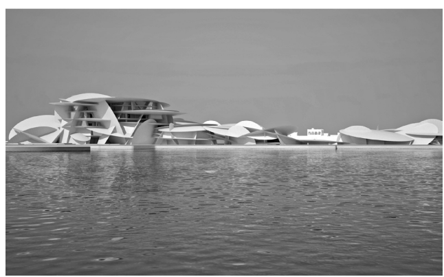
Figure 4: Qatar National Museum

and society. So is this modern need to position oneself on the global stage and to simultaneously hold onto a historically rooted culture through the creation and weaving of narratives and artificial references an ethical way for the non-western world to develop its built environment? Is the holding on to constructed and flat identities the way to preserve national identities? Does the abandonment of these identities eradicate the alterity and otherness of today's world and create a homogenized one? Levinas argues that we need to accept the otherness of the other, are artificial references the only way