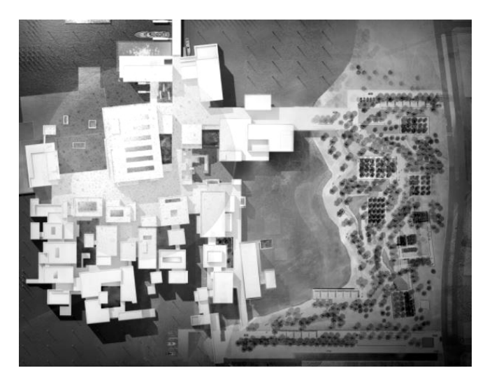
Figure 3: Plan of the Louvre Museum in Abu Dhabi, United Arab Emirates.